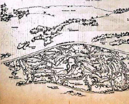
City of Aiken

"Long before DeSoto crossed the Savannah in search of gold and was welcomed by the Indian Princess Cofitachiqui in her domain a few miles to the south of Aiken, the rolling, wooded acres of Houndslake afforded a mecca for the Creek Indians who populated the region. Houndslake now affords a permanent mecca for many people from many places.